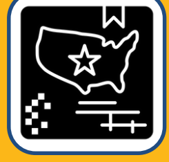
America: Through Music Videos