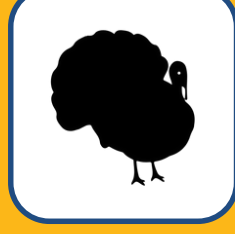
Thanksgiving: Who's Telling the Story?

Still not sure? Choose one of the lessons below: