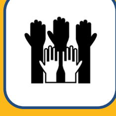
Roots of Democracy in the US: Iroquois or Athens