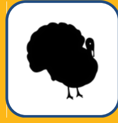
Thanksgiving: Who's Telling the Story?

Still not sure? Choose one of the lessons below: