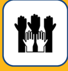
Roots of Democracy in the US: Iroquois or Athens