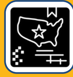
America: Through Music Videos