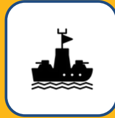
WWII D-Day: Two Views: Soviet & American