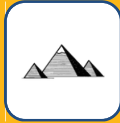
Ancient Nubia & Ancient Egypt: What's the Story

Still not sure? Choose one of the lessons below: