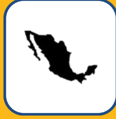
Mapping the Border: Who Decides?