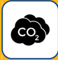
Carbon Trading: Arguments For & Against

Still not sure? Choose one of the lessons below: