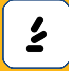
Marketing OxyContin: Profits, Lives, Disinformation